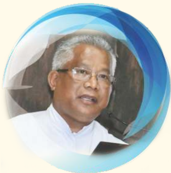
Summary of Fr. Provincial’s Talk during the Jubilee of Confreres

Three years went by, and today it is 46 years of life in the missions and I thank the Lord for this missionary vocation which allowed me to exercise my Priestly ministry in a very tangible and fruitful way. My prayer to St. Francis Xavier bore much fruit. I’m sure that every Jubilarian present here, would have many marvellous episodes to narrate, and fascinate us all.